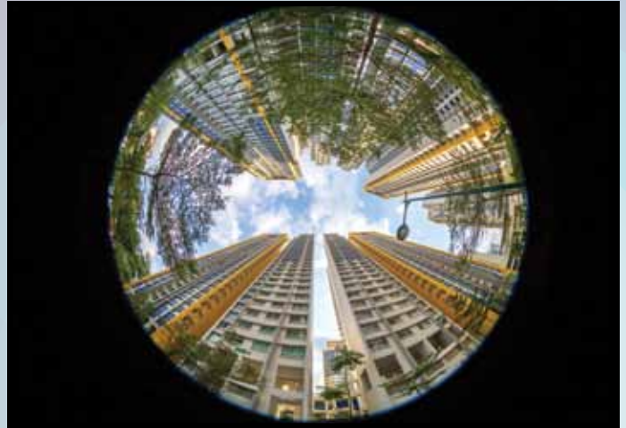
"Fisheye view of Ang Mo Kio Flats" by Seow Swee Meng (Teck Ghee)