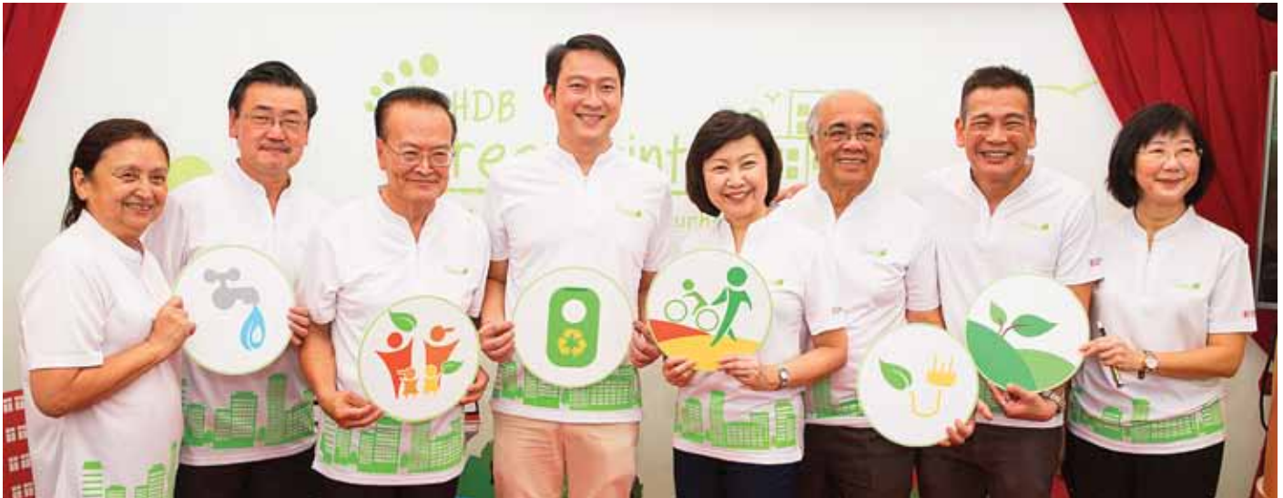
VIPs at the launch holding symbols for the six main thrusts of Greenprint (l to r) Water Conservation, Community Engagement, Waste Management, Green Commuting, Energy Conservation, Landscaping and Greenery.