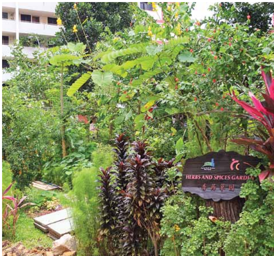
The Golden Garden award winner in the 2013 AMK in Bloom Awards.

If you're a community gardener who thinks your garden is the bee's knees, speak with your RC to arrange to enter the contest. Registration begins in September, so you still have quite some time to weed, prune, water – and seek some secret gardening tips from that auntie or uncle who used to be a farmer!