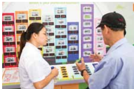
At the launch exhibition, you could pick the spots where you wanted the new bike parks.

Work will include an automated waste collection system, solar panels on roof tops, LED lighting, better foot-paths, cycling tracks and bike parking facilities, more greenery around and